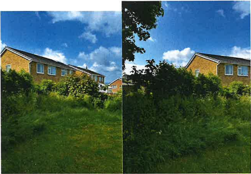
Photos from resident property at Birchlands having hedge issues